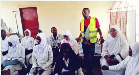
Salaam, first Lifesavers for DR Congo alhamdulillah and their new Islamic Medical Association