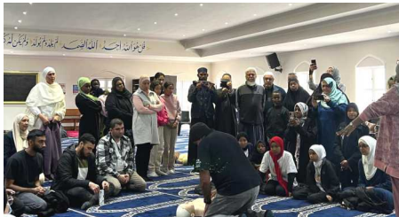
South Africa IMASA doing a great job as usual...