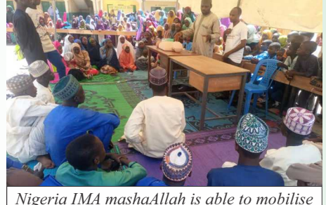
Nigeria IMA mashaAllah is able to mobilise large numbers across the country...