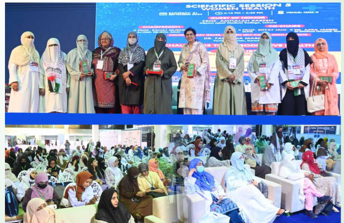
Women health session