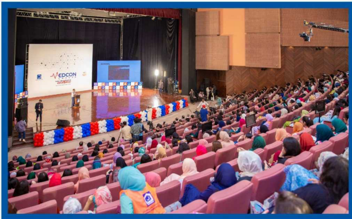
Hundreds of distinction holders medical students from 39 medical colleges of Punjab attending Alkhidmat Medcon at Expo Center Lahore.