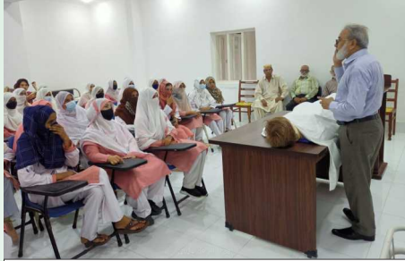
As are PIMA in Pakistan...