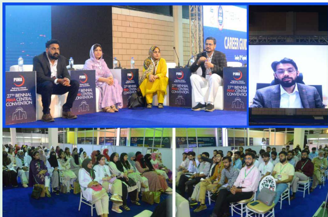
Career guidance seminar