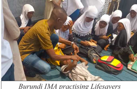
Burundi IMA practising Lifesavers mashaAllah