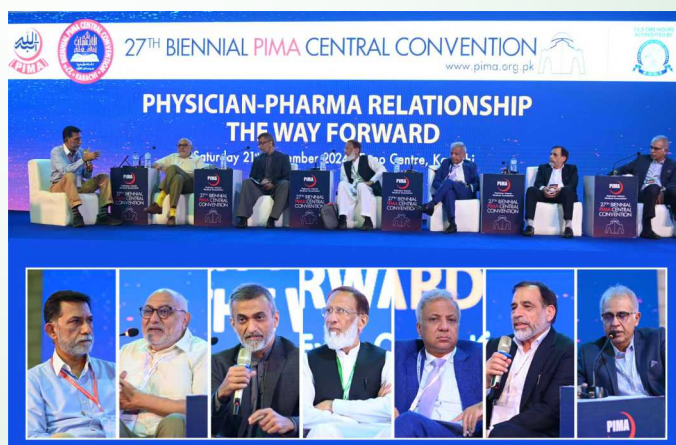
Panel Discussion: Physician-pharma relationship, the way forward