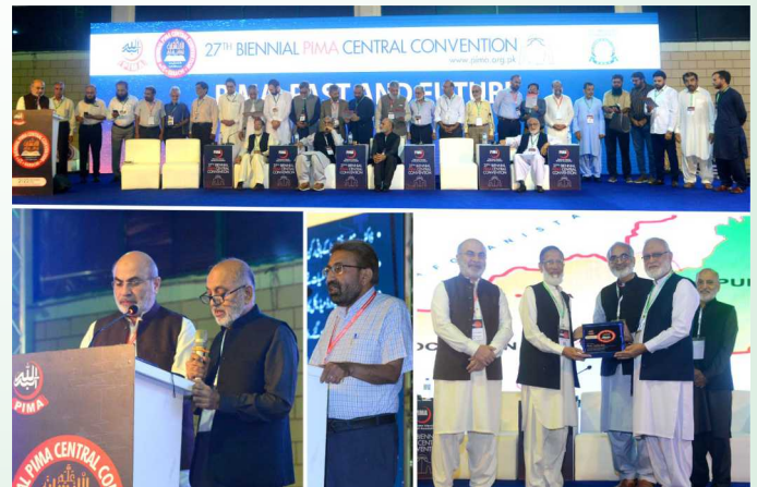
PIMA: past and future